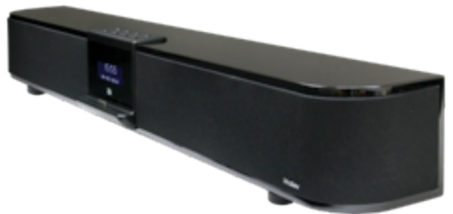
Haier Evoke Series 3D Sound bar: Powered by Sonic Emotion Absolute 3D

The Evoke Series 3D Sound bar has been conveniently designed to meet the demands of today's lifestyles. A single device with no calibration required, Sonic Emotion Absolute 3D has brought 3D listening and audio experience, together, customized to any room. One Haier 3D sound bar will immerse an entire room in Absolute 3D sound without the need for additional speakers, bringing any content to life in 3D.