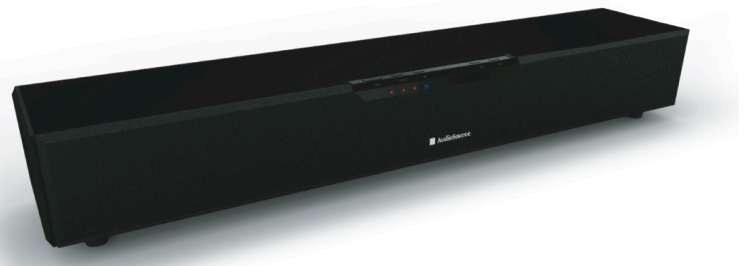
Sonic Emotion and AudioSource unleash the S3D40 sound bar to US market.