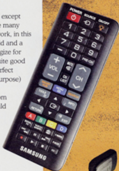
A QWERTY keypad is on the flip side of Samsung's remote.

"Samsung's are the most comfortable active 3D glasses I've ever worn."